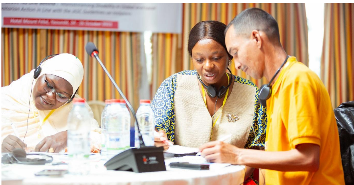
Participants during a regional workshop on disability inclusive humanitarian action, held in Yaoundé in 2023.

Despite the progress that has been achieved with the endorsement of the IASC guidelines, disability inclusion is still not systematically anchored in Humanitarian Needs Overviews (HNOs) or Humanitarian Response Plans (HRPs). The following case study aims to illustrate the practical integration of disability inclusion into the HRPs in Cameroon for 2023 and 2024. By showcasing the successes and challenges encountered during this process, this case study aims to provide practical insights and lessons learned that can be applied to enhance disability inclusion in humanitarian responses globally. We hope that this example will inspire other humanitarian actors to adopt similar approaches in other contexts.