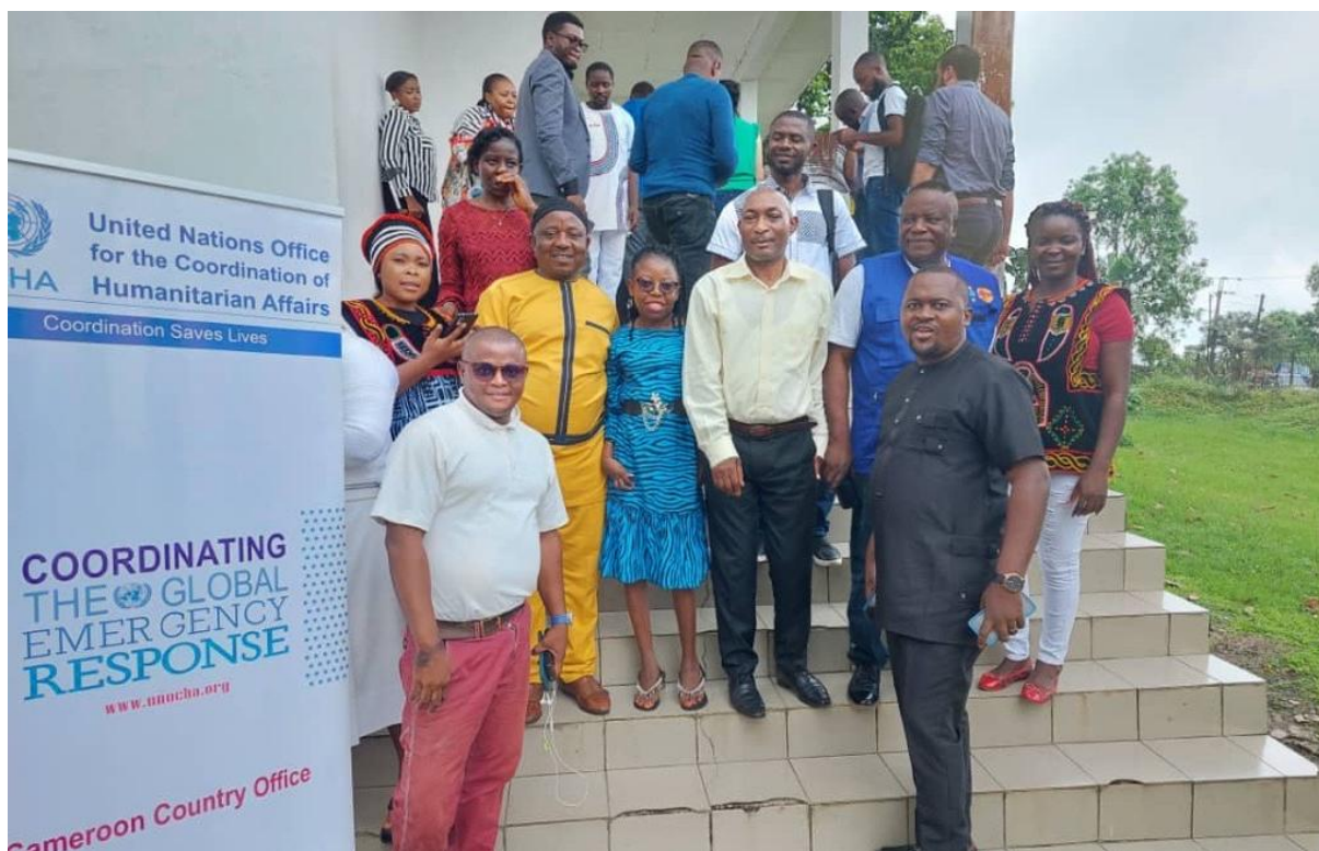
Participants of the HNO Workshop in Buea, held in October 2023.