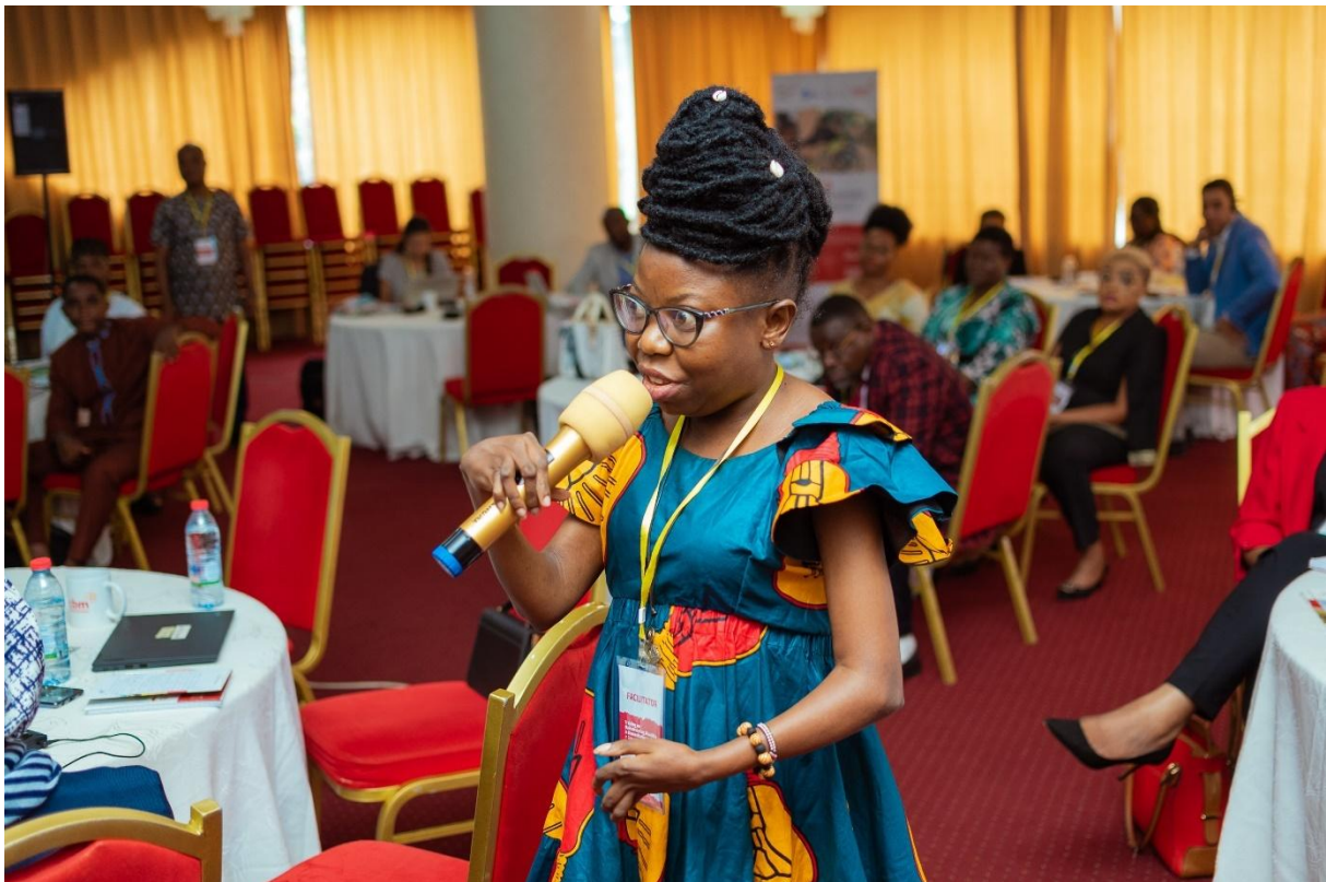
The CBM DID Officer is providing input during training for various humanitarian actors in Cameroon.

Furthermore, it was highlighted that not all OPDs have had the opportunity to actively engage in the Pool's activities', underlining the need for more inclusive participation and equitable opportunities. In collaboration with CBM the Pool members have therefore planned to pass on their knowledge to more OPDs and OPD members, which have not yet benefitted from dedicated capacity development.