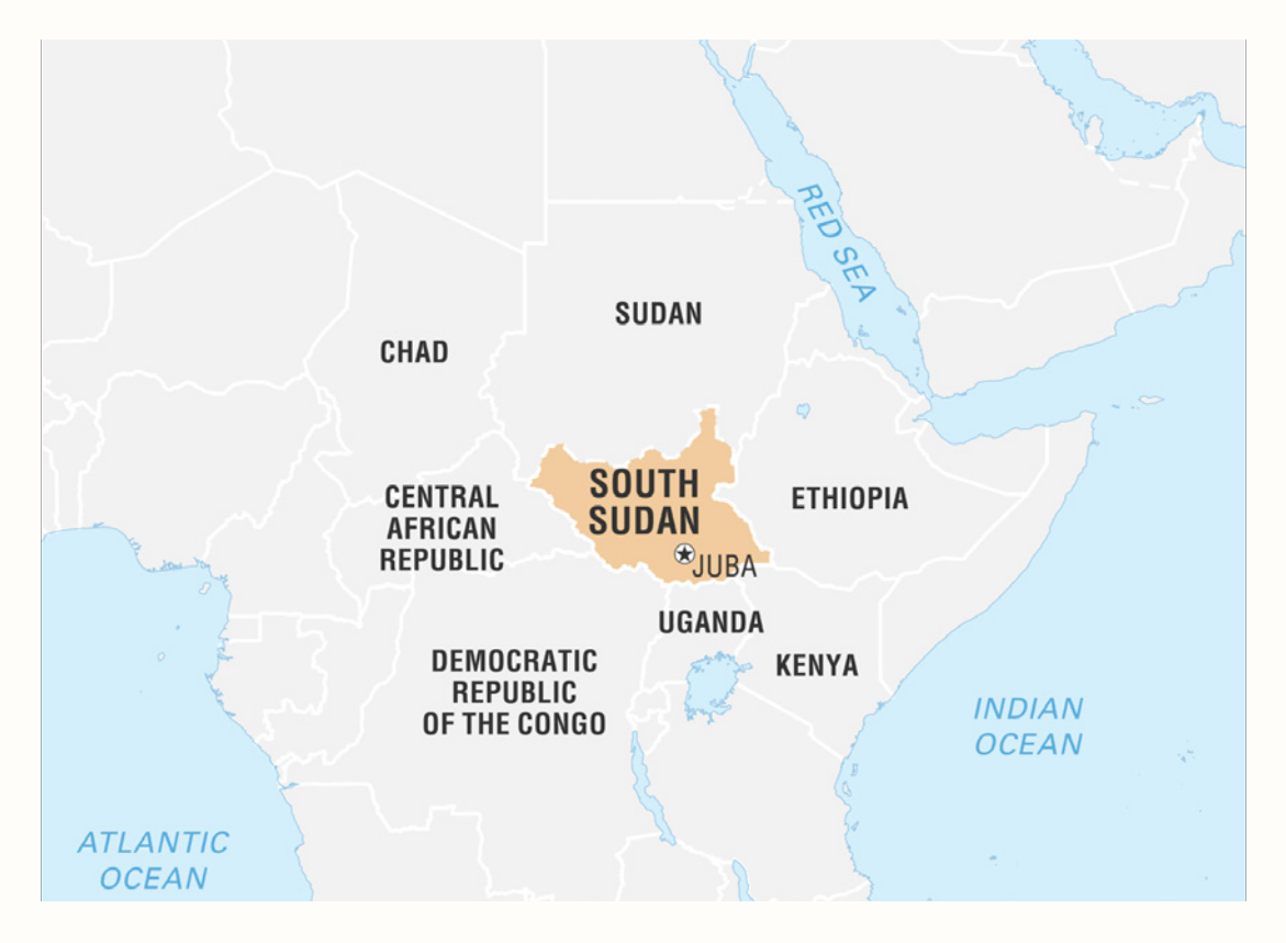
Map 2. South Sudan and its Neighbouring States